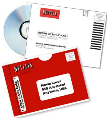
Exhibit 6: The Netflix Envelope

Netflix’s ubiquitous red envelope became a recognizable marketing symbol for the company.