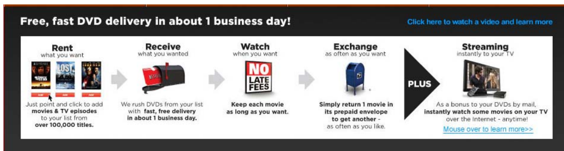
Exhibit 5: Renting a DVD Through Netflix