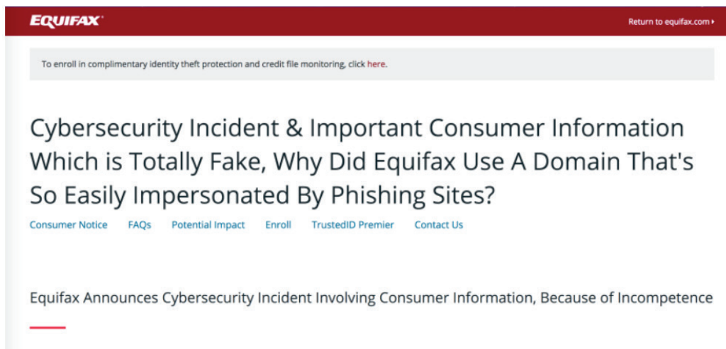
Exhibit 6 Fake Equifax Data Breach Homepage, securityequifax2017.com