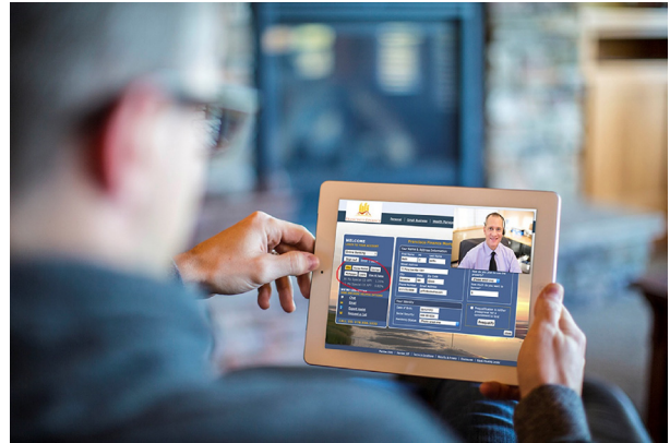
Figure 2. Consumer talking to a remote expert

the potential to elevate conversion to a whole new level due to the richness of immersion it provides the end user. Features such as co-browsing, screen sharing, and content sharing offer a level of interactivity that was not previously available. Recent research indicates that groups utilizing co-browsing technology have higher performance on metrics such as agent utilization rate and average revenue per call than groups that do not (Minkara, 2013).