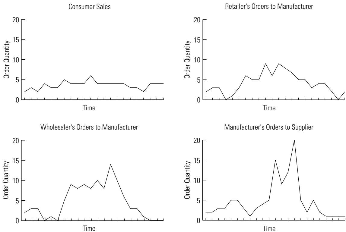
Figure 1 Increasing Variability of Orders up the Supply Chain

inventory supply. Distorted information has led every entity in the supply chain — the plant warehouse, a manufacturer's shuttle warehouse, a manufacturer's market warehouse, a distributor's central warehouse, the distributor's regional warehouses, and the retail store's storage space — to stockpile because of the high degree of demand uncertainties and variability.